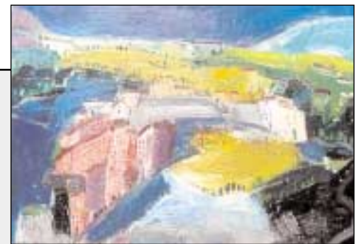
"Chasing Soutine", acrylic.

REGULAR GALLERY HOURS Wed. – Sun. 12 noon to 4:00 pm