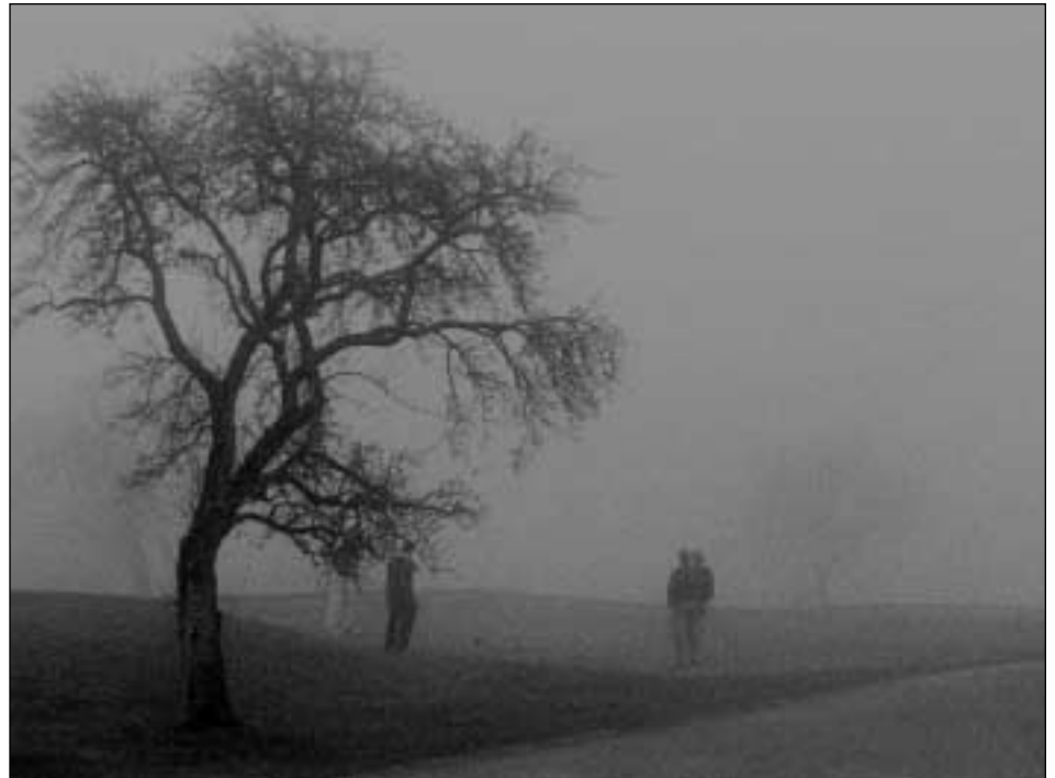
"Golfing at Redding"

As an engineer I can relate to this very well. Most of the general public thinks of electrical engineering as a precise science. In a way it is. But it is as much so as there are just so many notes on a piano, or what one can manipulate on a string of a guitar by pulling on it. In other words, there are limitations, and engineering is governed by the laws of physics. But for the same reason that there are many ways to compose an alternative to an arrangement of a piece of music, there are also a thousand ways