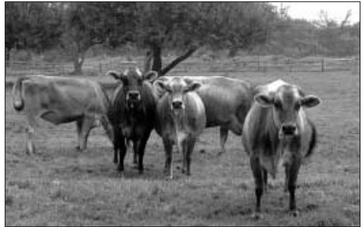
"Hey, What Are You Looking At?", photograph by Wayne Chou.

As far as fast cars are concerned, I wouldn't say fast was necessarily the criteria for the fondness of a car. I don't have a solid recollection of the number of cars that I have owned in my lifetime, but I would say in excess of 50. The first car that I owned was a sports MG, then a Jaguar MC 340, Porsche 1600 Super, Mercedes 220 SL, Mercedes, 190d, and another for a short while a Mercedes 300 SL gull wing, another Porsche 911, a Mercedes 220 d, and then another one after that was totaled. And the list goes onto having the Mondial and the